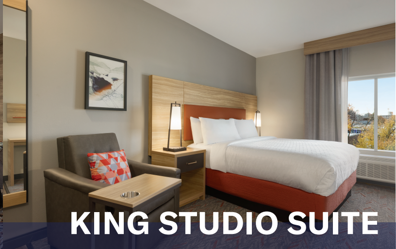
KING STUDIO SUITE